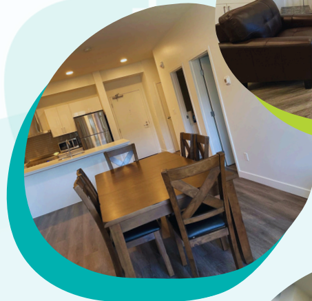
Apartments at Horizon Ridge